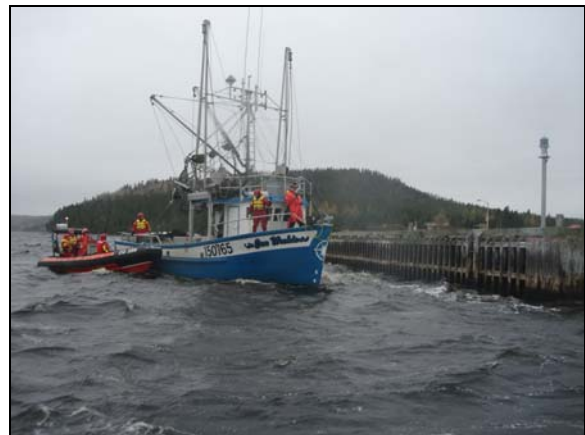
Photo 1. The Sea Urchin on the day of the occurrence

The vessel is powered by a marine diesel engine with a reverse/reduction gearbox driving a single fixed-pitch propeller and is fitted with a single plate centreline rudder. A total of four built-in diesel tanks are arranged on the port and starboard sides of the engine room and the lazarette.