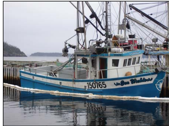
Photo 2. The Sea Urchin after recovery

On 03 November 2007, the owners 2 of the Sea Urchin were contacted by the Canadian Coast Guard (CCG) to assist in fast rescue craft (FRC) training. 3 That afternoon, the Sea Urchin , with two of the three owners acting as operator and crew, respectively, arrived in Salton's Brook, Newfoundland and Labrador (N.L.). A CCG instructor joined the vessel early on 04 November 2007. The vessel – with a total of three persons on board – then departed for Newman Sound, N.L., accompanied by two FRC, each with a crew of four CCG personnel.