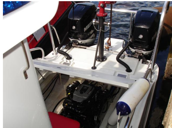
Photo 8. Engine compartment hatch