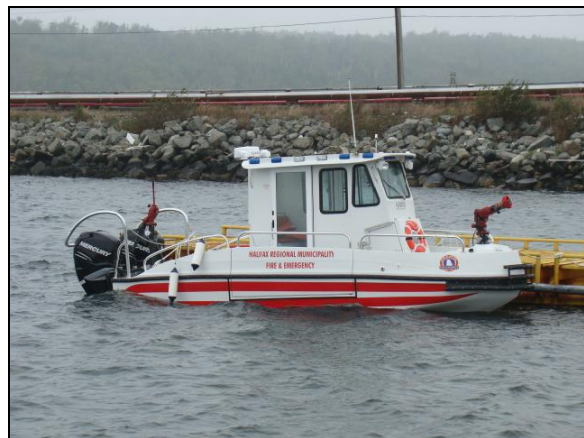
Photo 1. Fireboat 08-448B

The vessel was designed as a fireboat of composite fibreglass construction with a moulded, progressive deep V-hull, fitted with a pilot house with seating for four inside and for two outside on the after deck. Access to the pilot house is through two sliding doors, port and starboard. The hull below the main deck is