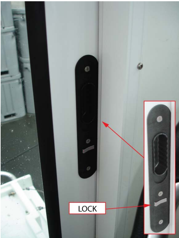
Photo 4. Port door interior latch