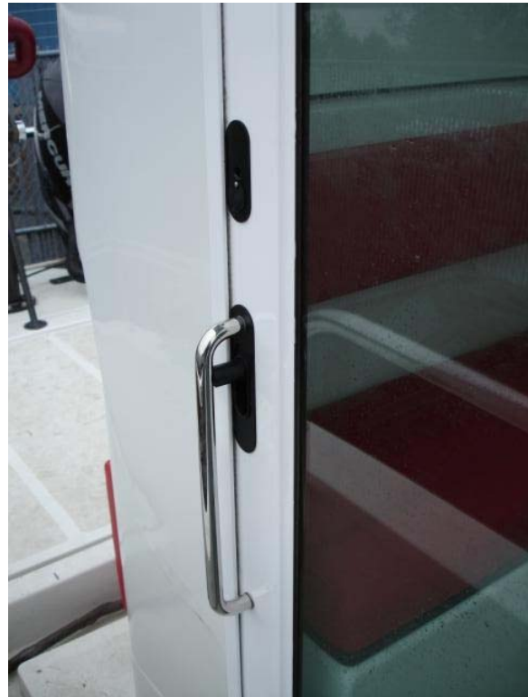
Photo 3. Looking aft at the starboard door handle and latch (installed upside down)