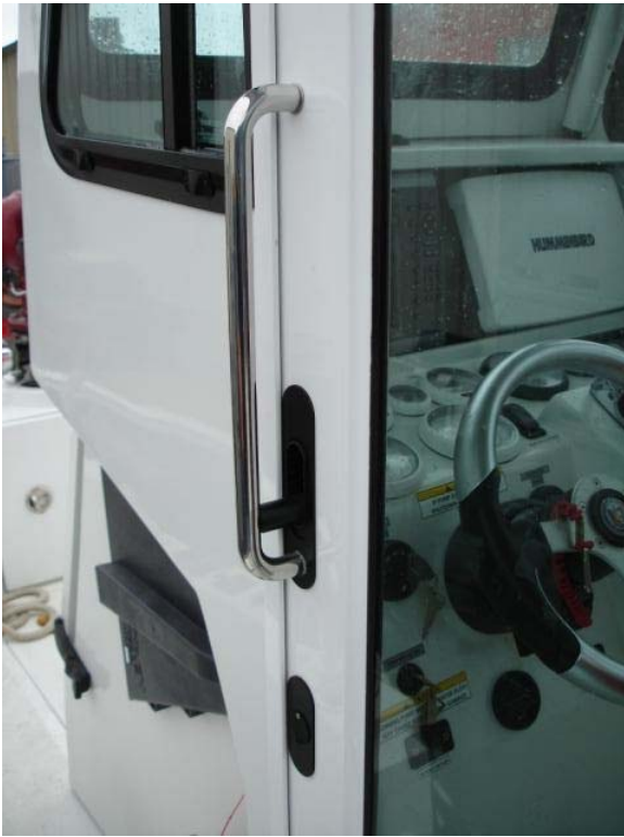
Photo 2. Looking forward at the port door handle and latch