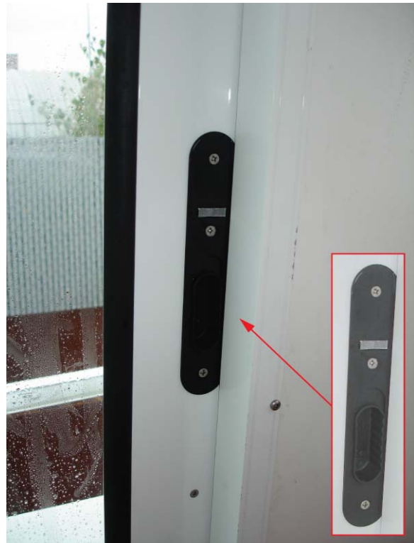
Photo 5. Starboard door interior latch (note position difference from port door latch)