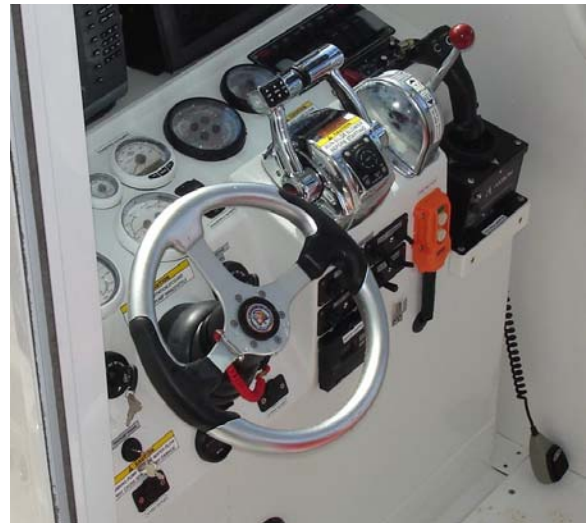
Photo 6. Kill switch and throttle position (note lanyard draped over steering wheel)

The engine kill switch (also known as the “dead man’s lanyard”) was not attached to the operator (see Photo 6). The purpose of such a lanyard is to stop the engines if the operator leaves the controls. Although the lanyard had been used during the training sessions earlier in the week, because the seas were calm on the morning of the accident, it was not used. Moreover, although in this occurrence both engines stopped immediately upon capsizing, not using this safety device could lead to a situation where engines continue to run with no operator.