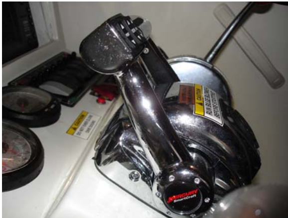
Photo 7. Throttle position (after capsizing) at three-quarters ahead

When the vessel began to heel to port, the instructor told the operator to increase throttle. This may explain why the three-quarter throttle setting (see Photo 7) and the amidships motor position conflict with reports that the vessel was in the midst of a slow, relatively tight turn at the time of the capsizing. It is also possible that the throttles were inadvertently pushed forward as the vessel decelerated while capsizing. The clutches were electrically controlled, and the investigation concluded that the port engine disengaged during the capsizing.