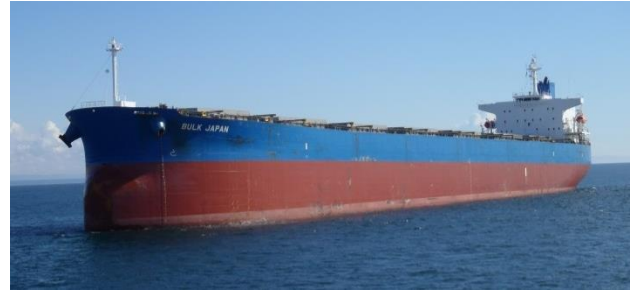
Photo 1. Bulk Japan

and hatches. The bridge is fitted with the required navigational equipment. The navigation console is offset from the bridge front wall and includes the steering wheel, which is on the centreline, and a telegraph from which the propulsion can be controlled. The navigation console also comprises of the vessel's 2 radars (3 cm and 10 cm) situated to the left of the steering wheel; both are fitted with automatic radar plotting aids (ARPA).