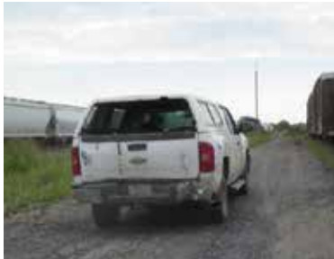
Photo 6. Damage to the pickup truck's bumper