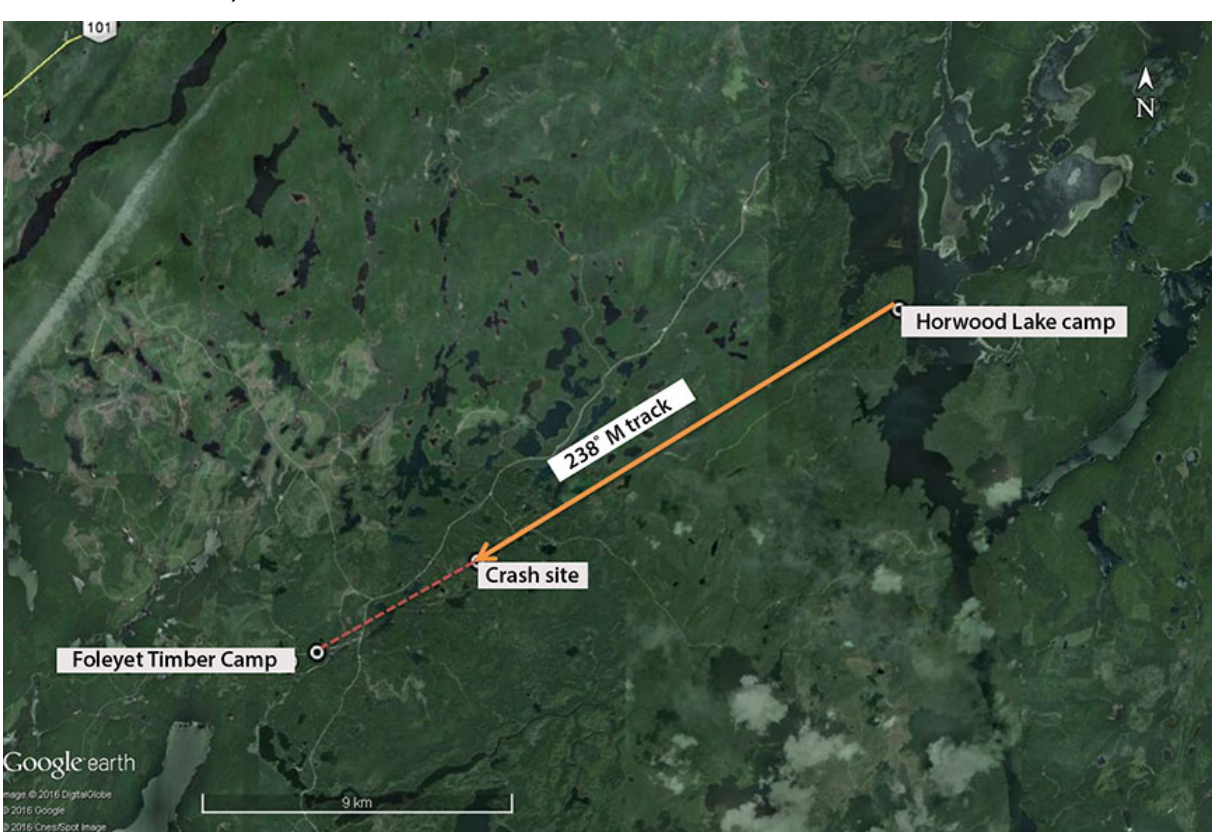
Figure 2. Map of the accident site along the direct route to the Foleyet Timber Camp.

At approximately 2130, the 2 support personnel who had gone to Timmins arrived at the FTC and noted that C-GZFX was not there. They found a flight itinerary that indicated that the pilot and the mix rig operator had gone to the EACOM supervisor's camp and would "be back soon." Because it was dark and the weather was poor, they assumed that the pilot and the mix rig operator had remained overnight at the Horwood Lake camp. No attempt was made to contact the EACOM supervisor or Apex personnel to inform them that the helicopter was overdue.