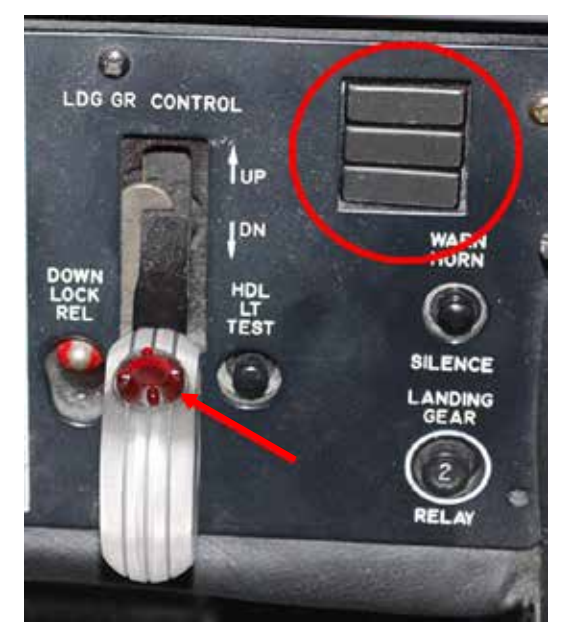
Figure 1. Beechcraft 1900D gear-down indicator lights (circled in red) and landing gear control handle (arrow)

tower observed that the nose landing gear was not in the fully extended position. The nose landing gear was trailing about 20° to 30° below the horizontal retracted position.