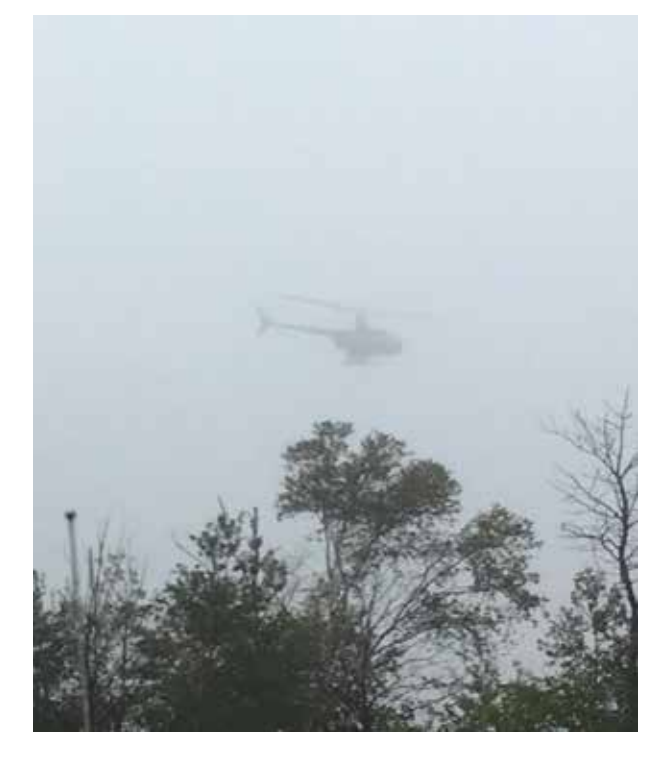
Figure 2. The occurrence helicopter seen at about 100 feet above the ground, 10 minutes before the accident, about 9 nm from CYKZ

700 feet AGL and overcast layer at 1500 feet AGL. The TAF also indicated a temporary change between 1300 and 2000 of visibility greater than 6 sm; no significant weather; scattered cloud layer at 800 feet AGL; and overcast ceiling at 1500 feet AGL.