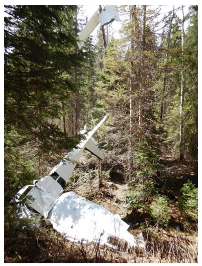
Figure 3. The occurrence aircraft at the accident site, with the right wing atop a tree

The aircraft struck multiple treetops along a nearly 500-foot-long path eastbound before striking a large tree trunk and descending steeply, coming to rest nose-down at the base of a small berm. The aircraft was destroyed due to collision with trees and terrain (Figure 3).