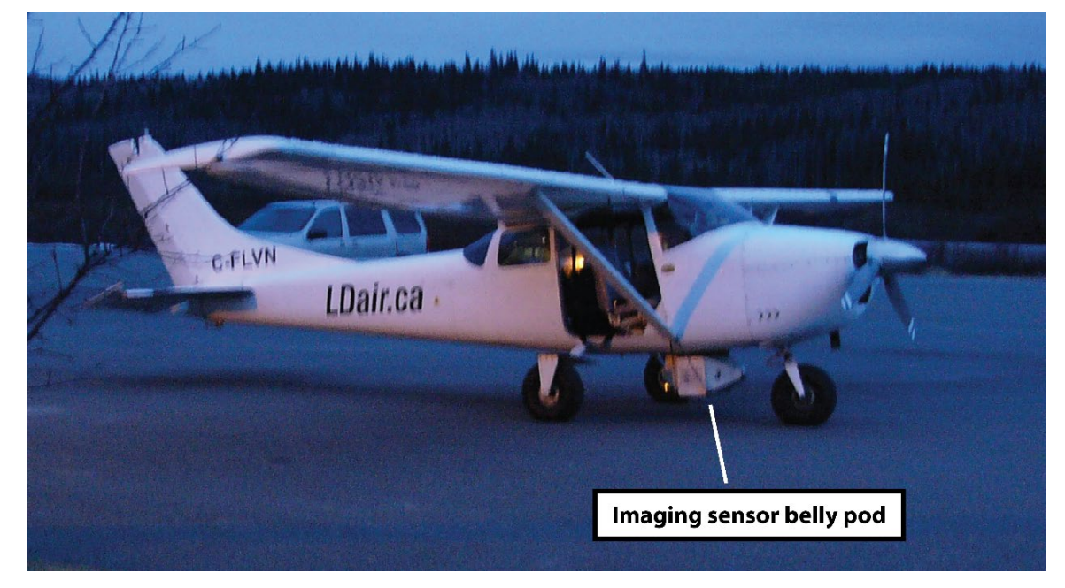
Figure 1. The occurrence aircraft on the morning of the accident with imaging sensor belly pod installed

On 01 May 2019, an imaging-sensor-equipped belly pod was installed on the aircraft (Figure 1), as per Supplemental Type Certificate (STC) SA4-662. On 02 and 03 May, flights were conducted to test and calibrate the scanning equipment to detect underground hot spots in areas of previous fire activity. During those flights, it was determined that the best scanning results were obtained when the aircraft flew at a height of between 3000 and 4000 feet above ground level (AGL) and a groundspeed between 80 and 90 knots. It was also determined that the scans were best performed early in the day, before solar heating of ground objects resulted in erroneous infrared signatures.