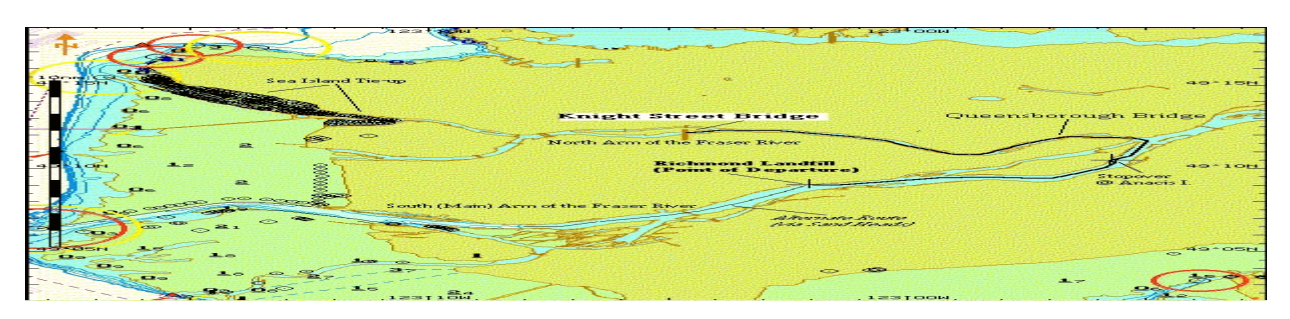
Appendix A - Sketch of the Occurrence Area