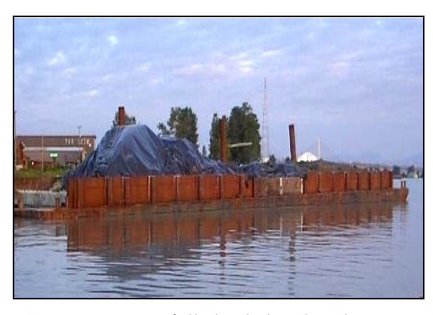
Photo 1 . Barge 216 fully loaded with soil as it was at the time of the accident. The bow is at left.

At about 1030 Pacific daylight time<sup>2</sup> on 03 June 2005, the Sandra Carol , with the lone owner/operator on board, departed Courtenay in a light condition for a shipyard in Port Alberni by way of Victoria. The distance to Victoria is approximately 120 miles.