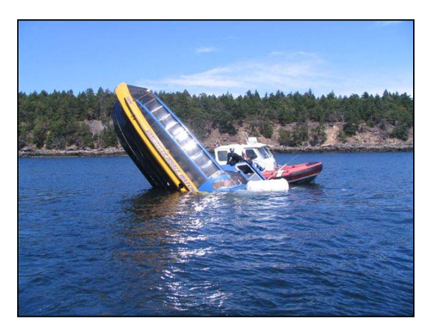
Photo 2. The Explorathor as it sank. Vertigo visible.

As a safety precaution, the owner of the Explorathor chartered an additional whale-watching vessel, Crazy Legs , to carry a portion of the passengers <sup>8</sup> from the Explorathor Express back to Steveston. The Crazy Legs arrived on scene at 1450. The JRCC was advised at 1604 that both vessels had arrived in Steveston.