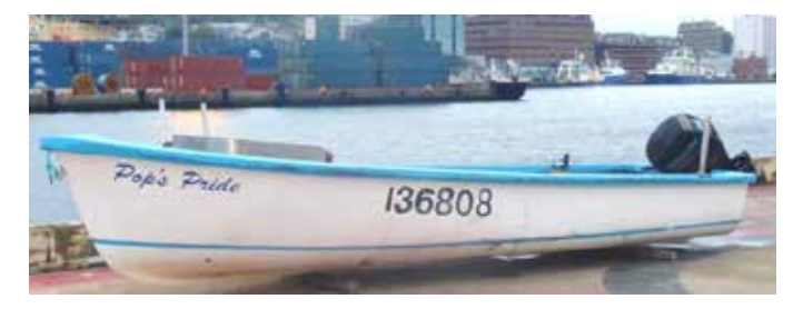
Figure 1. The Pop's Pride

The Pop's Pride (Figure 1) is a small fishing vessel constructed of moulded, glass-reinforced plastic. It is propelled by a single 60 hp outboard motor aft. The vessel is used to fish multiple species, including cod and lobster.