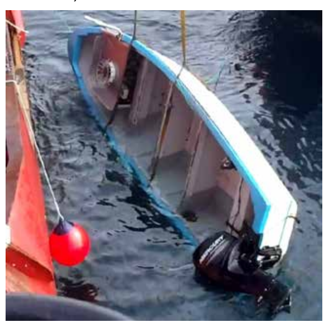
Figure 3. Recovery of the Pop's Pride

He did not hold a marine certificate of competency, as was required by regulation.<sup>6</sup> The master had sufficient experience to obtain a declaration of at least 7 fishing seasons as master of a fishing vessel pursuant to subsection 212(8) of the Marine Personnel Regulations , which would have met the requirement for a certificate of competency for this vessel, but he had not pursued the declaration.