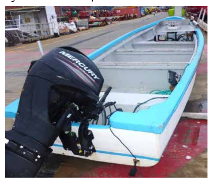
Figure 2. Interior of the Pop's Pride

The drain hole is 35 cm to port of the vessel's centreline, and is just above the vessel's inner bottom but below the waterline. To drain any water that has accumulated on board, the crew would normally accelerate the vessel until it was planing. The forward motion of the vessel and raising of the bow when planing forces the water on board to flow aft, toward the vessel's transom. When the drain hole plug is removed, the water accumulated at the stern then drains out of the drain hole until the plug is reinserted.