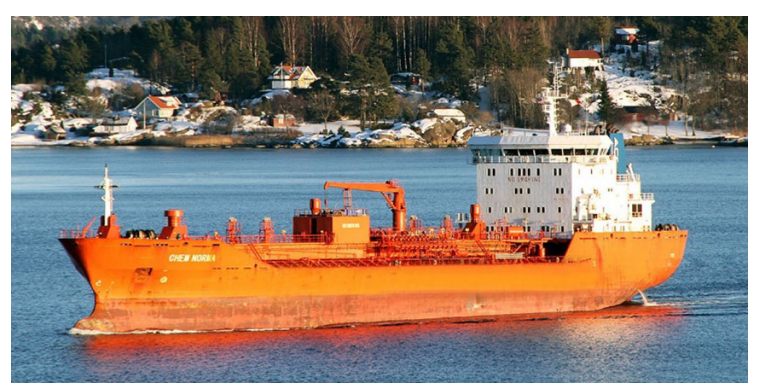
Figure 1. Product/chemical tanker Chem Norma

On 29 May 2018, the Marshall Islands–flagged product/chemical tanker Chem Norma (IMO 9486192, Figure 1) was proceeding upbound the St. Lawrence Seaway, carrying a cargo of 11 119 tonnes of alkylate (UN1268) bound for Sarnia, Ontario. The bridge team at the time consisted of the master, a pilot, the third officer, a helmsman, and a lookout.