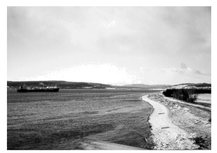
THE "JADE STAR" AGROUND ON SHORE OF PRESQU'ÎLE DE PENOUILLE 48°50.97'N, 064°25.15'W HEADING 302° (G)