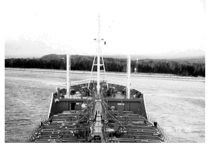
WHEEL-HOUSE VIEW AMIDSHIPS