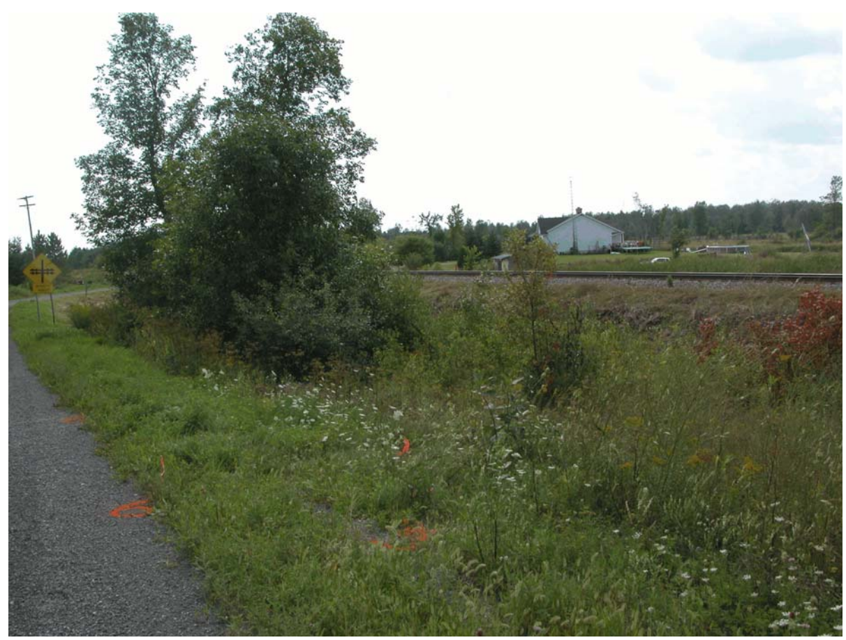
Photo 1. Driver's view to the right of the approach of Kettles Road crossing