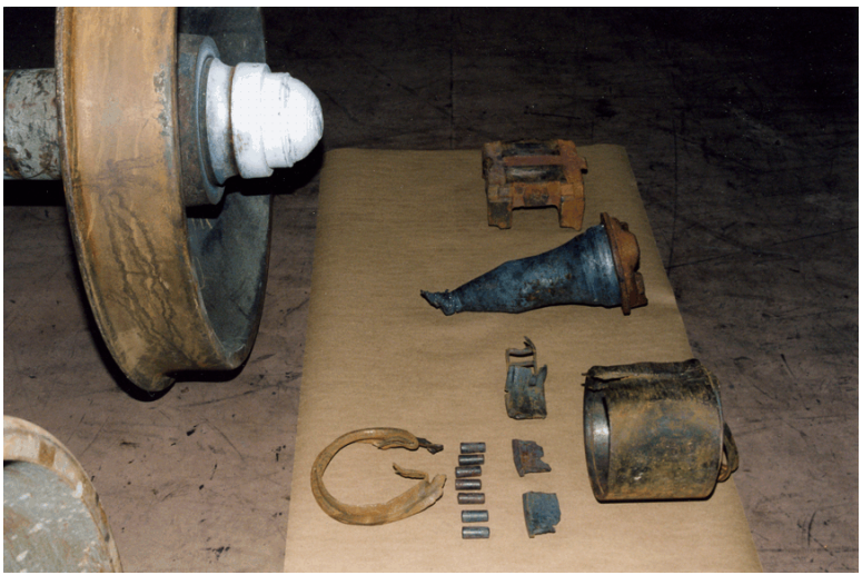
Photo 1. Wheel and axle journal (R-2) with some of the recovered pieces

The recovered pieces of the roller bearing (see Photo 1) and the adjacent wheel sets (No. 1 and No. 2 positions) were forwarded to the TSB Engineering Laboratory in Ottawa, Ontario, for further examination and analysis (report LP 093/2005).