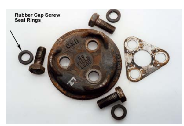
Photo 2. Rubber cap screw seal rings, with cap screws, end cap, and locking plate, in roller bearing at L-2 and R-2 positions