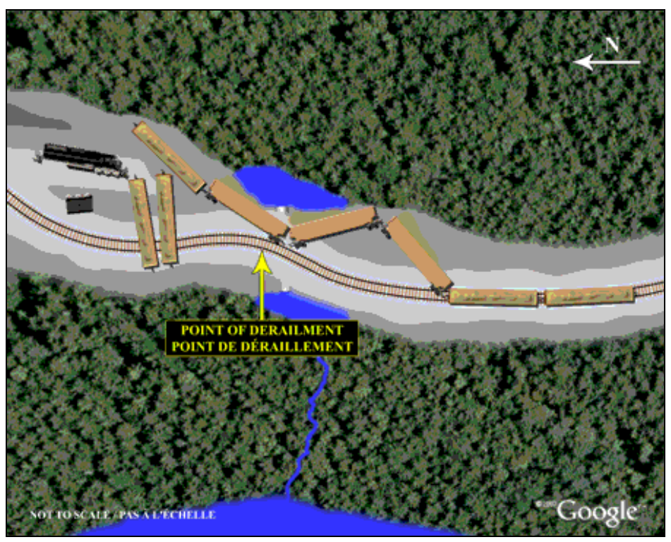
Figure 2. Location of derailed rolling stock

An examination of the locomotive showed that the wheel rims were blued<sup>9</sup> (see Photo 2), with some showing signs of skidding. The brake shoes were thermally damaged.