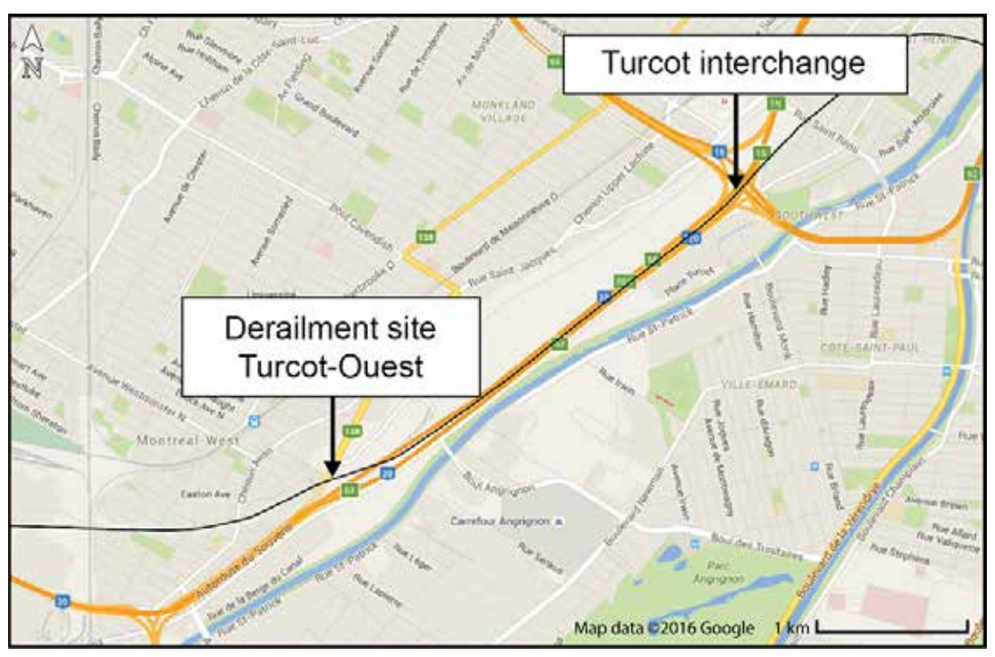
Figure 1. Site map

On 11 December 2015, at approximately 0910,<sup>1</sup> VIA Rail Canada Inc. (VIA) passenger train No. 605 (the train), travelling to Hervey-Jonction, Quebec, left Montréal Central Station in Montréal, Quebec, carrying 14 passengers. One mile later, the train entered the Montreal Subdivision travelling on the north track to Turcot-Ouest, at Mile 6.20 (Figure 1).