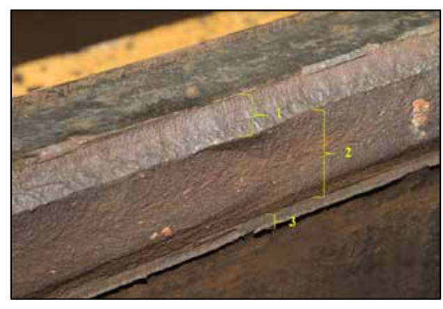
Figure 5. Shelling on the running surface at one end of the rail section