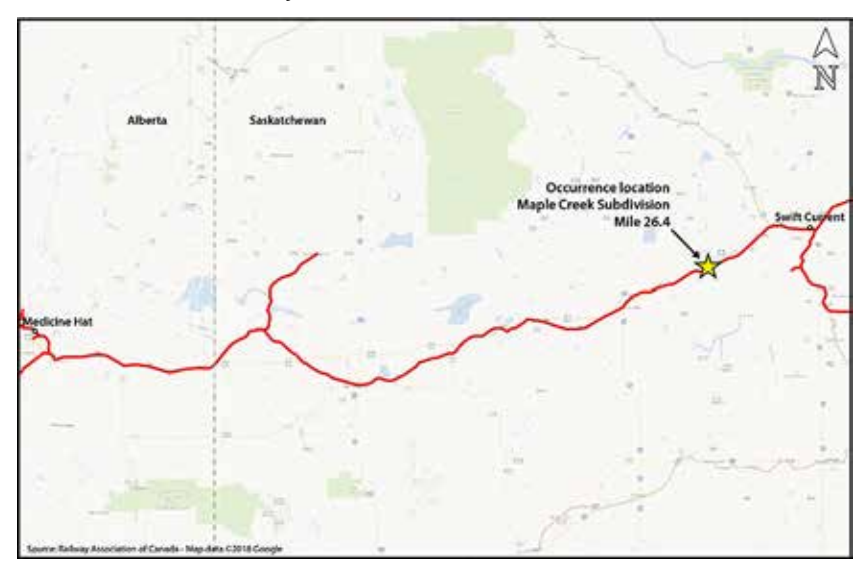
Figure 1. Map of the occurrence area

At about 2010, while proceeding at 48 mph, the train experienced a train-initiated emergency brake application at Mile 26.4 of the Maple Creek Subdivision. The lead locomotive came to a stop near the Antelope grain terminal at Mile 28.0. The crew made the required emergency radio call, and then inspected the train. It was determined that 37 cars had derailed: the 107th car to the 142nd car.