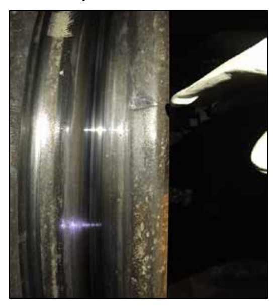
Figure 3. Impact marks on the north-side wheel of CNPX 3795, the 105th car

the fractures in the rail were due to overstress as a result of the derailment. However, the gauge side of the rail head was missing on one of the rails. There were indications of a vertical split head (VSH) on this rail. The approximately 2-inch-wide fracture was relatively uniform with a ½-inch band of fatigue cracking along the top edge (zone 1), a ½-inch band of fatigue/shear along the bottom edge