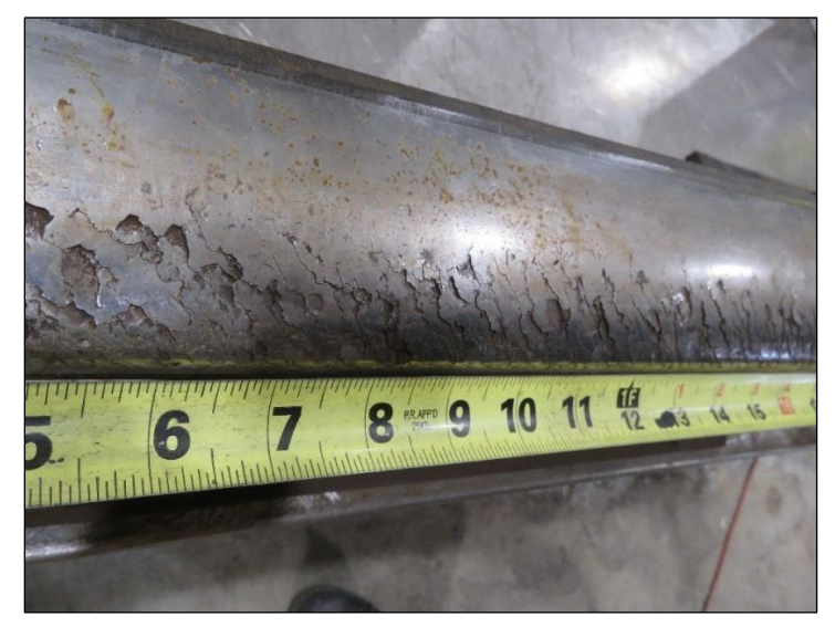
Figure 6. Condition of running surface of the rail head recovered at the occurrence site

Two of the pieces of recovered rail exhibited pre-existing detail fractures on the fracture faces. Detail fractures are classed within a group of fatigue defects known as transverse detail defects (TDDs), in which the plane of the crack is perpendicular to the running direction of the rail.