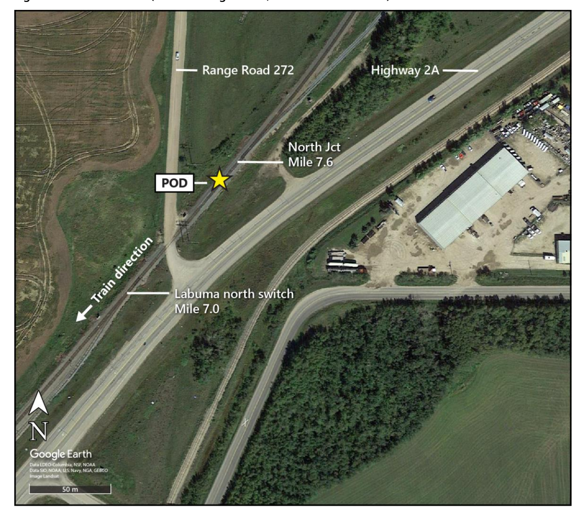
Figure 2. Occurrence site

As a result of the derailment, diesel fuel was released from 1 tank car, and octanes were released from 2 tank cars. There were no injuries or fire reported.