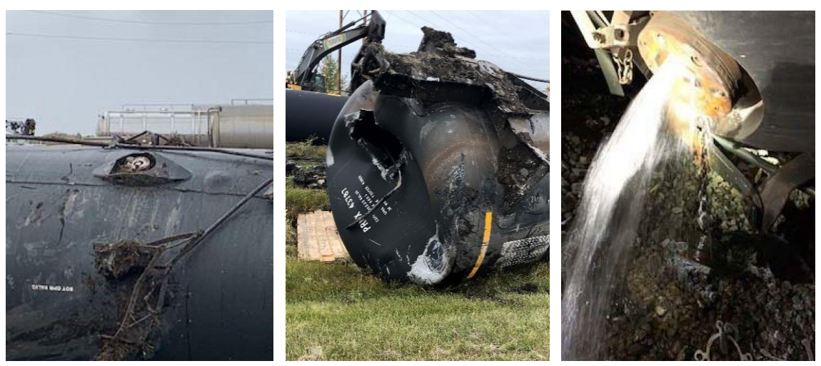
Figure 5. Damage to car PROX 43741

A review of maintenance records indicated that the 3 cars had been maintained to industry and regulatory standards.