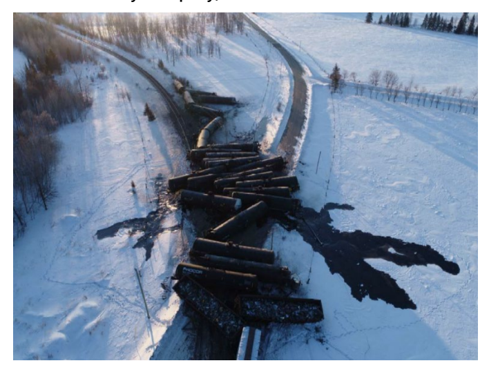
Figure 2. Aerial view of the derailment site

seats. This caused the rail to become unseated from the tie plate and left the rail susceptible to gauge spreading under the load of the train, which led to the derailment. This is a phenomenon commonly referred to in the rail industry as "ice jacking".