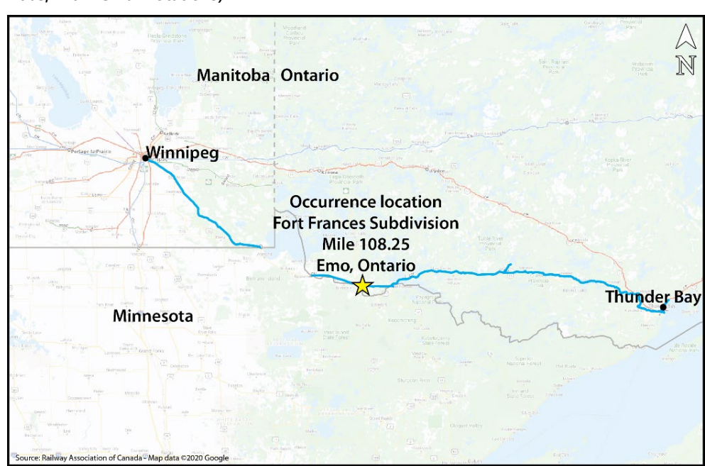
Figure 1. Occurrence location

At 2036, while proceeding at 44 mph,<sup>6</sup> the train was negotiating an approximately 4° left-hand curve (in the direction of travel) as it traversed the Ontario provincial highway 602 public automated crossing (Mile 108.22) when a train-initiated emergency air brake application occurred near the township of Emo, Ontario (Figure 1).